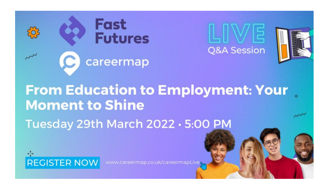
Year 13 Students - Fast Futures Q&A

Join Fast Futures on Tuesday 29th March at 5pm to hear from four young people who were in exactly that position not too long ago and are now in amazing careers within the largest industries in the world!