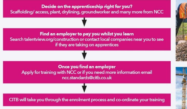
The construction industry is booming and there are many opportunities to start a lifetime career. Whether you want to work locally or all over the world, work for a large house building company or run your own business. You can gain the skills to help you achieve your goals.

There are 100s of trades available with apprenticeships to enable you to train whilst you earn, with the prospect to gain permanent employment once you qualify. So what do you need to do?