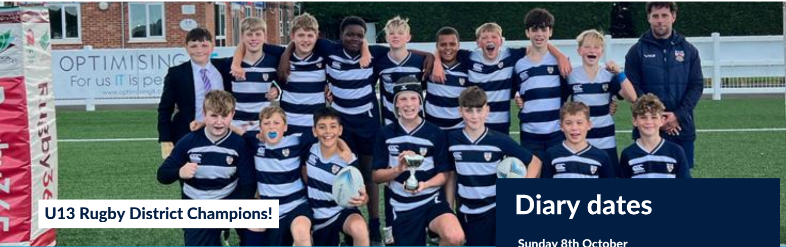
U13 Rugby District Champions!