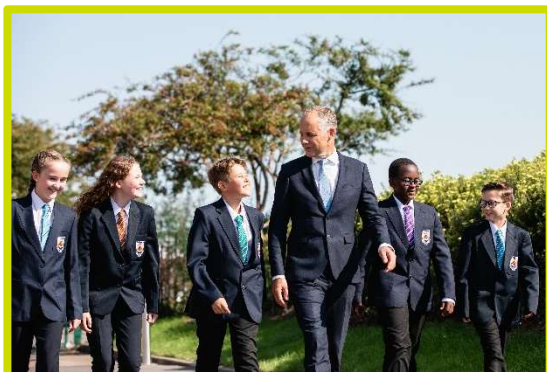
Empowering lives through learning

We are looking to appoint a Marketing and Communications Manager to lead our marketing and communications strategy by assuming responsibility for all marketing-related activities including the school's online presence, external communications, marketing collateral, brand management, and support for school events.