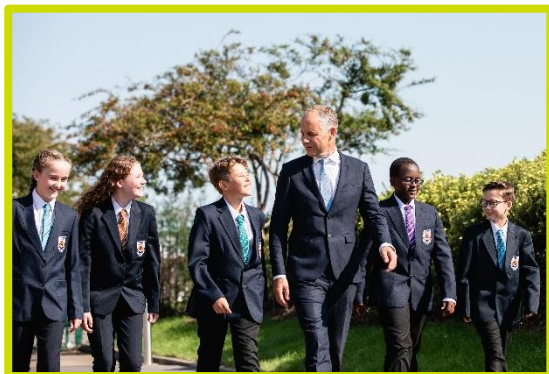
Empowering lives through learning

We are looking to appoint a cleaning assistant to join our cleaning team.