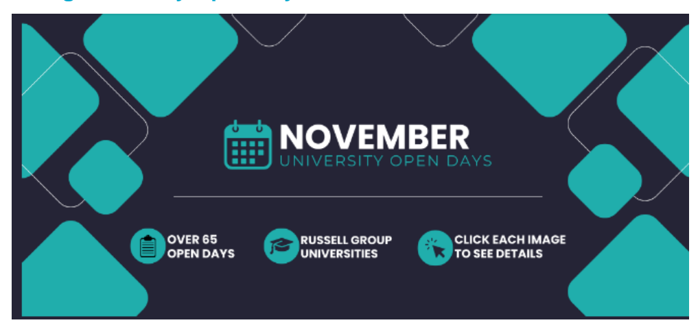
Year 12 – Upcoming University Open Days

Please click the link <u>HERE</u> to access a full list of University open days for November. This is the last big batch of open events before the UCAS deadline on 31<sup>st</sup> January 2024.