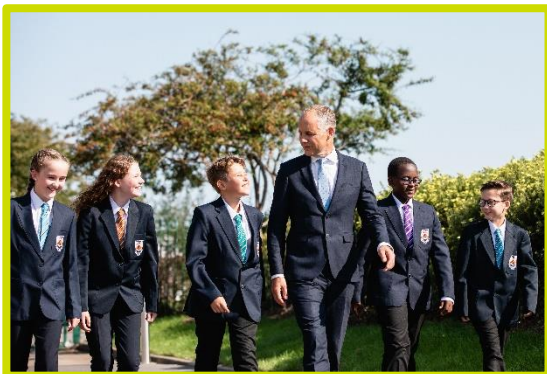
Empowering lives through learning

We are looking to appoint two Teaching Assistants to work within our Special Educational Needs Department, supporting the effective operation of the SEND provision on a day to day basis in school.