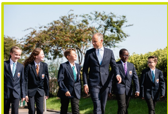
Empowering lives through learning

We are looking to appoint an enthusiastic teacher of Computing and ICT to join an experienced and enthusiastic Computing and ICT department, based in our purpose-built Computing block, at Cheltenham Bournside School, where Computing and Creative iMedia are very popular subjects.