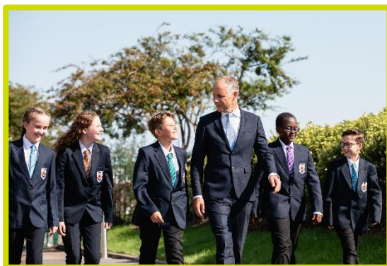
Empowering lives through learning

We are looking to appoint a Site Operative to join and support the site team. You will work under the guidance, support and direction of the Estates and Facilities manager.