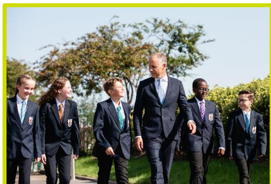
Empowering lives through learning

We are looking to appoint two personal trainers to join our sports centre team and support all aspects of all sports facilities providing a high-quality customer service to all users including students, staff and external customers.