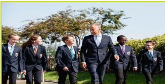
Inspiring lives through learning

Application pack: www.bournside.gloucs.sch.uk/school-information/careers-at-bournside/