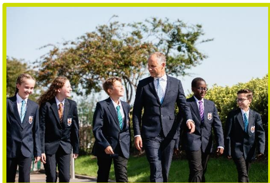
Empowering lives through learning.

We are an established 11-18 single academy trust with a good reputation (Ofsted 'Good' rating 2022), wide catchment, and a strong presence in our community. Our school is consistently oversubscribed with a PAN of 300, and most of our students choose to stay with us for their post-16 study.