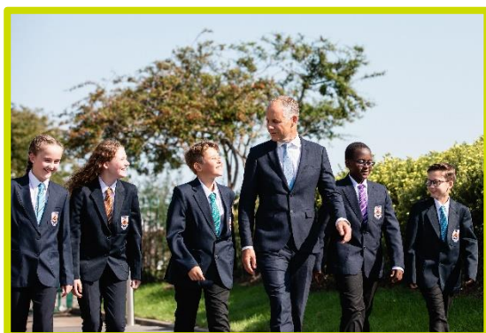
Empowering lives through learning

We are looking to appoint cleaning assistants to join our cleaning team. As part of this role you will be required to support the sports centre.