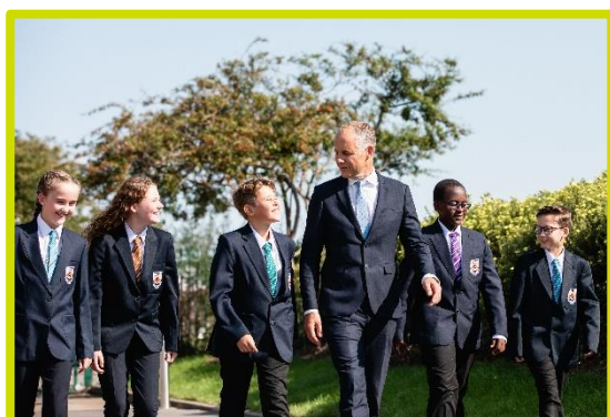
Empowering lives through learning

We are looking to appoint a Business Centre Administrator to support the operations department during a period of maternity leave.